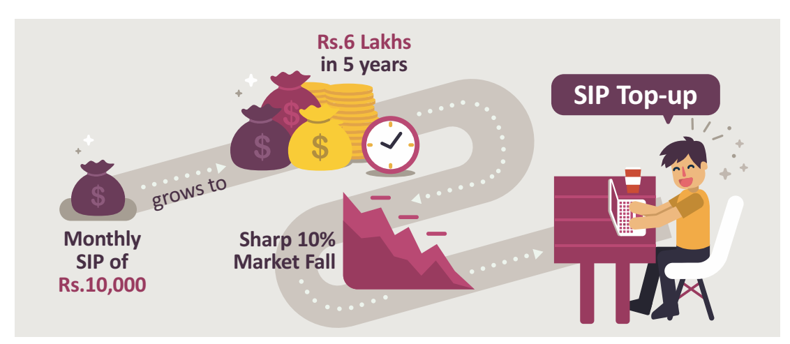
The above is only for illustration purpose.

Solution: An intelligent way to combat this risk is to do an SIP Top-up in such situations. By increasing the SIP amount in tandem with the growth in corpus one can ensure that averaging is done effectively.